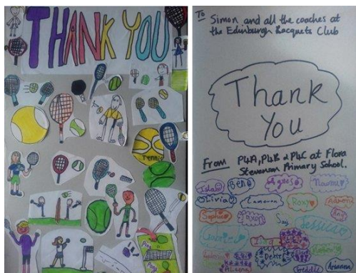
The thank you card signed by all the Flora Stevenson pupils