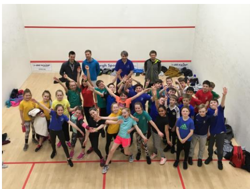
The Flora Stevenson visitors demonstrate their enthusiasm

Flora Stevenson thank you card + group photo