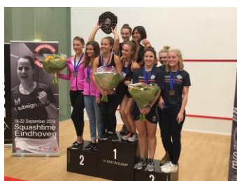
Our ladies unexpectedly win the Bronze medal