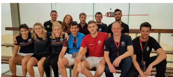
The happy team squad